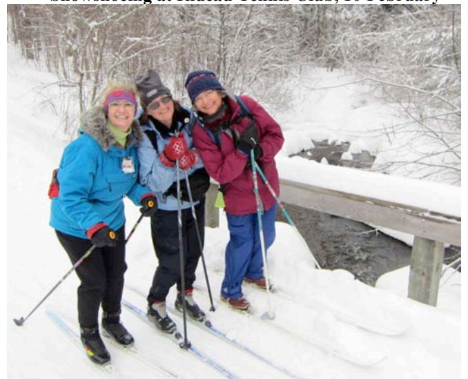
XC ski to Lusk Lake, 6 March