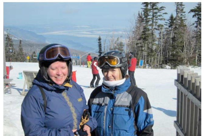
RA skiers at Le Massif

On Saturday after skiing, some of us went into Quebec City for dinner, and a few of us hitched a ride with them to a local restaurant - the St. Bernard. We liked the food there so much that we got the bus driver to take us there again the next night.