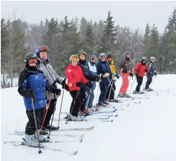
Meet 'n' Ski at Calabogie, 7 January

Our mid-week meet 'n' skis were well attended. Early in the season we had to cancel the first two due to lack of snow, but as the season got rolling there were usually 6-8 people attending most events. Fifteen people enjoyed perfect ski conditions at our meet 'n' ski to Calabogie in January. We did move some mid-week meet 'n' skis due to weather, and changed location a couple of times to take advantage of special $10 days and a $1 day at Mont St Marie. By popular demand we added another three weeks of meet 'n' skis at the end of the season.