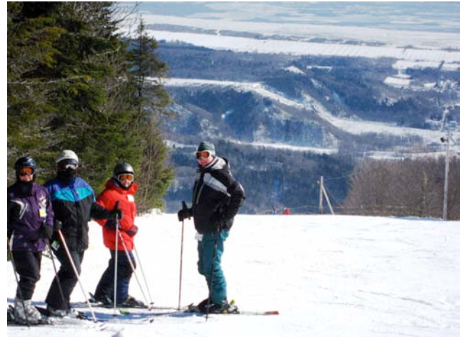
Skiing at Mont Sainte-Anne

The hotel rooms were well equipped and roomy. The hotel had a restaurant and a bar where we could get food. There were two outside hot tubs and an indoor swimming pool and hot tub. Cross-country skied Park Mont Sainte-Anne and the downhillers skied Mont Sainte-Anne Saturday and Monday, and Le Massif Sunday. Some of the runs were icy Saturday, but those who persevered found runs that were not icy and retired to the outdoor hot tub to meet the others. The skiing was good Sunday and Monday.