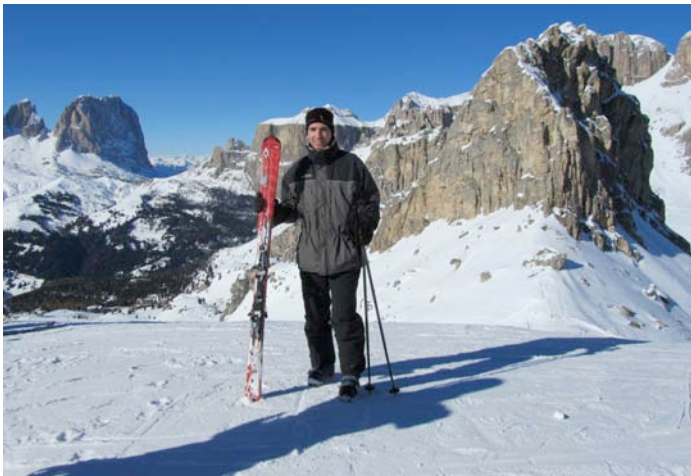
Skiing at Val Gardena, Italy