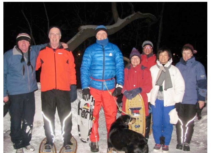
Snowshoeing at Rideau Tennis Club, 10 February