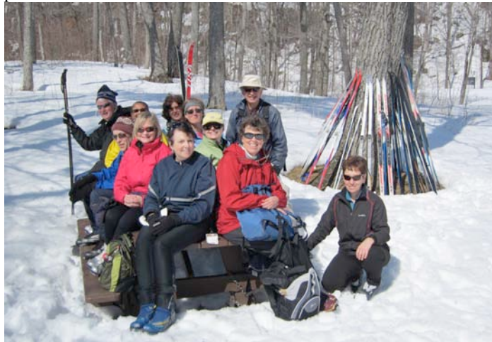
XC skiers at King Mountain, 20 March

After a slow start to the ski season, a couple of big snowfalls in February and early March allowed for some memorable trips in Gatineau Park. Unfortunately, the freaky March weather, consisting of snow followed by rain, wreaked havoc on the later part of the schedule.