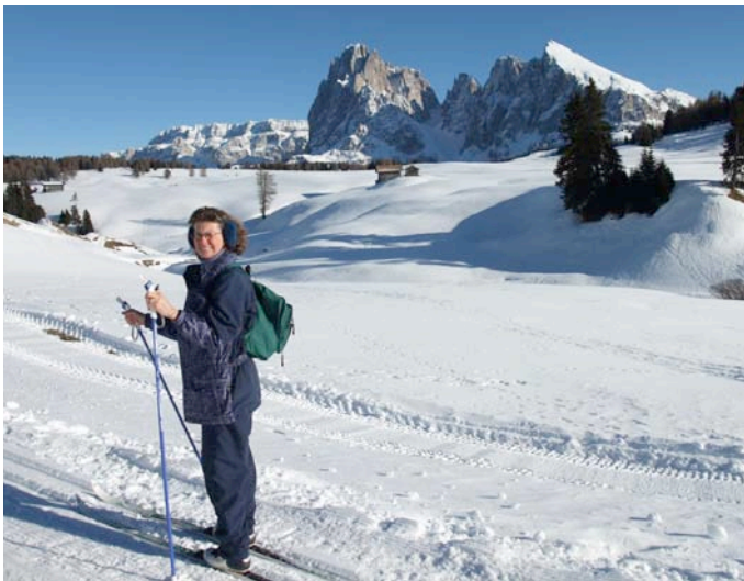
Cross-country skiing at Val Gardena

As was expected, the overnight trip to Ortisei was exhausting. The return trip was much more pleasant than the outbound trip. We left the hotels around 9:45 am and arrived at our Venice airport hotel about 2:00 pm, so most took advantage of the free afternoon and evening to visit the old city of Venice for a walking tour and dinner. The morning flight Sunday enabled us to leave at a reasonable time and do the trip in a single day. Several of the group members have been kind enough to pass on their thanks for a great experience.